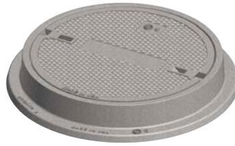
Type A solid cover illustrated

Options Special lettered covers Grates Gasket seal covers Medium duty covers Extra heavy duty ductile iron cover